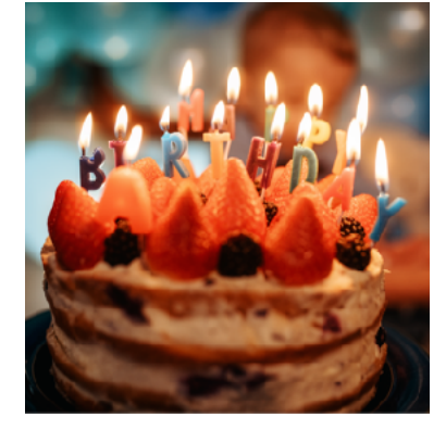
Candles to celebrate a birthday or anniversary.

Many religious festivals use candles in their celebrations. Candles are a symbol of hope and guidance and the victory of light over darkness and good over evil.