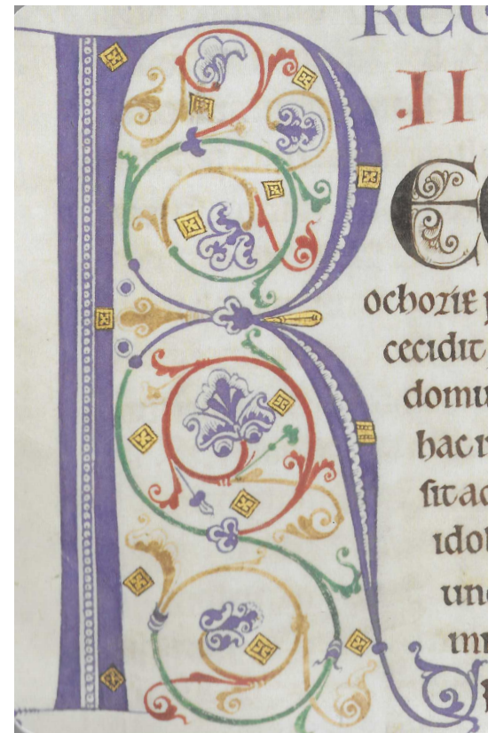
12th century English Bodleian Library