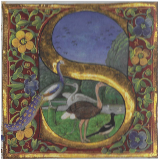
15th century Historia Naturalis Pliny 1476 Bodleian Library

Decorating letters is an activity which has been enjoyed for thousands of years. Beautiful examples are in our libraries and museums and can be seen on line.